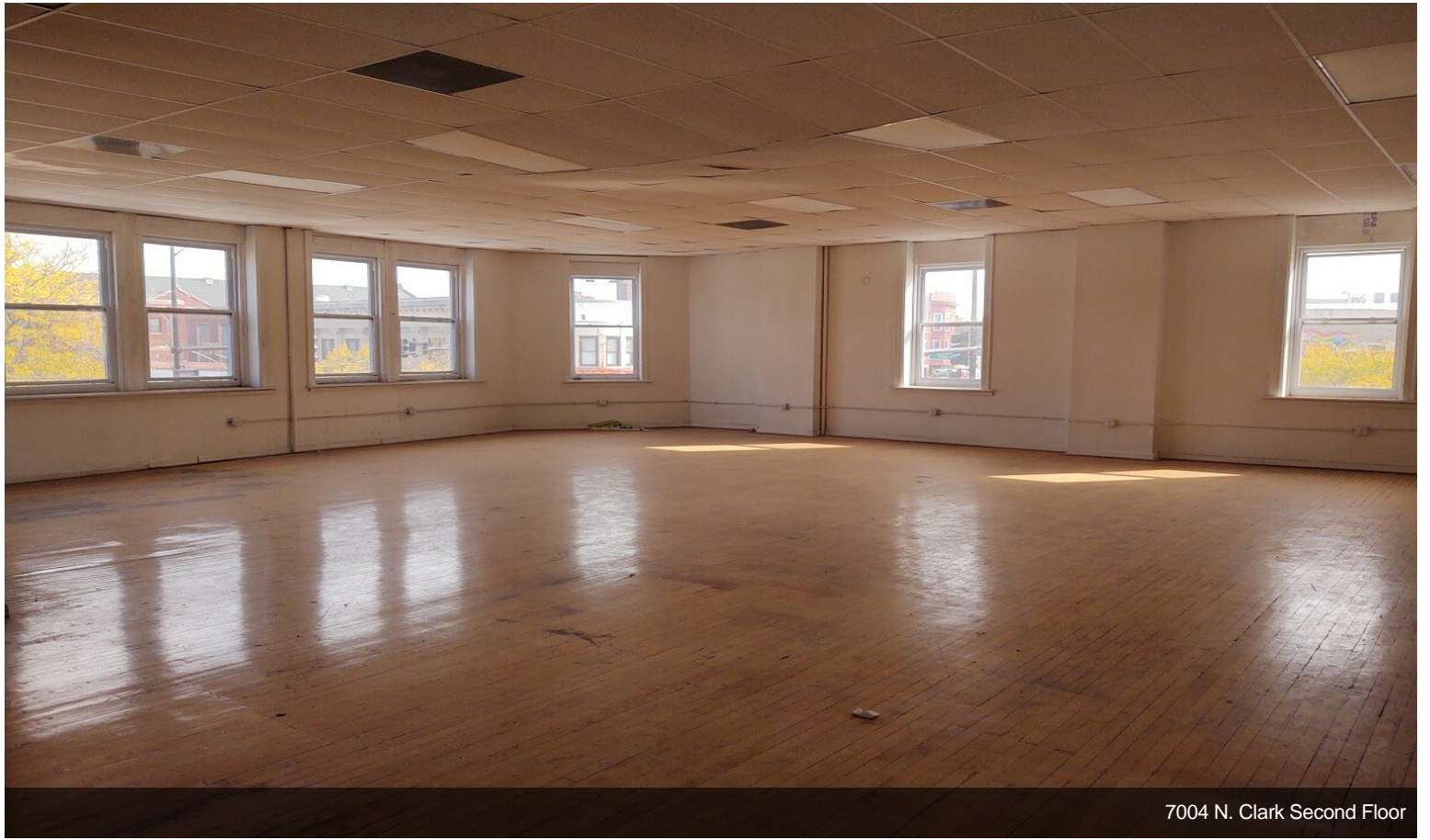
7004 N. Clark Second Floor