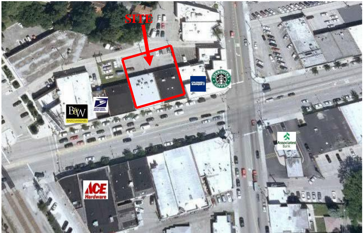
HIGH VISIBILITY INTERSECTION OF DEVON AND CENTRAL IN THE HEART OF THE EDGEBROOK COMMUNITY