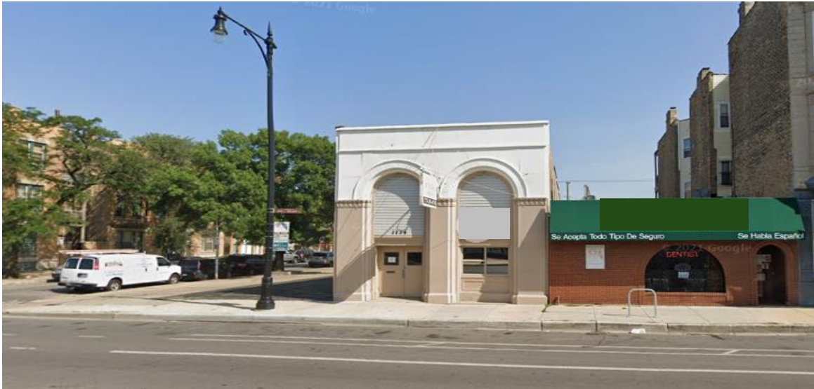
HIGH VISIBILITY CORNER (NORTHEAST CORNER OF NORTH & SAWYER AVENUES)

3234 W. North Avenue/1617 N. Sawyer Avenue, Chicago, Illinois