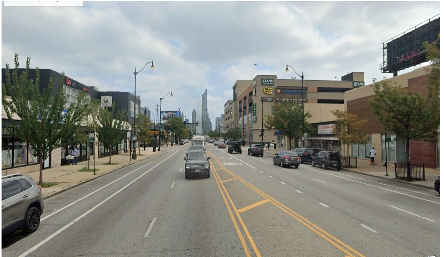
ROOSEVELT ROAD LOOKING EAST